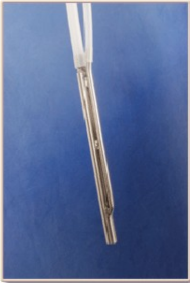
3/4 Inch Pump